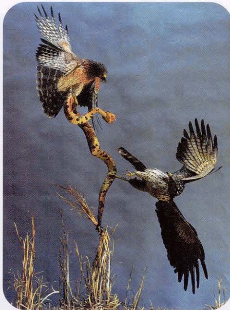
Red-shouldered Hawks and Copperhead Snake