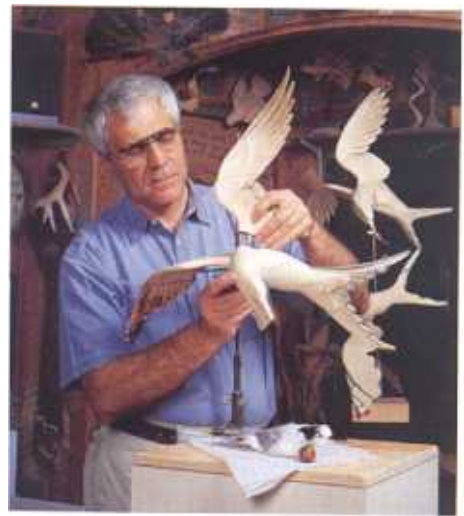
In bis studio, McKoy assembles individually carved pieces of "Tern" (above), giving it a lighter-than-air appearance. "Sanderlings" (top), 1986, basswood, metal, walnut and oil paint.

"Gamecock," 2000, basswood, bronze and oil paint, celebrates the bicentennial of the city of Sumter, S.C., named after Thomas Sumter, the "Fighting Gamecock" of the Revolutionary War.